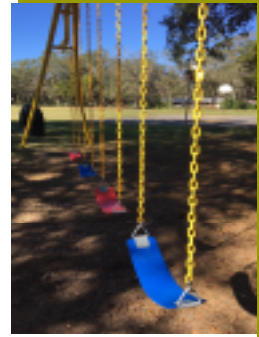
Sparkling clean seats on a bright frame