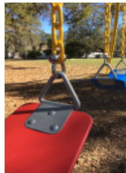
New chains and high-grade hardware outfit the seats