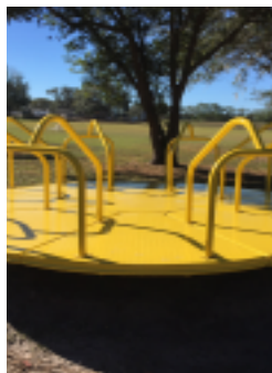
Gleaming fresh paint adorns the merry-go-round